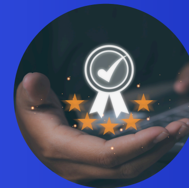
Getting certified in a new skill