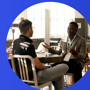
Getting a mentor