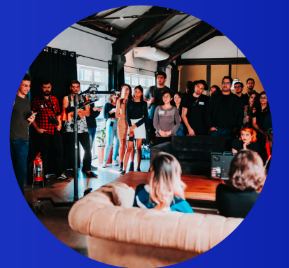
Attending networking events