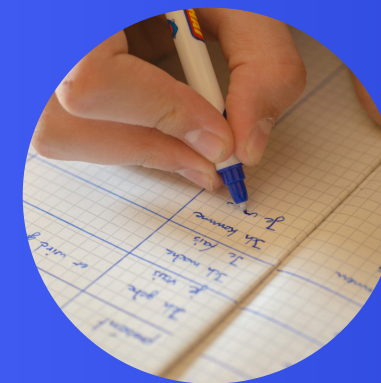
Learning a new language

What is the best way to develop your skills and advance in your job?