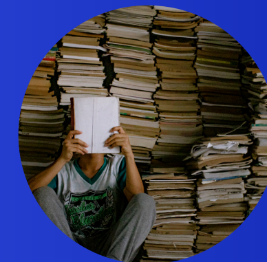
Reading industry-related books