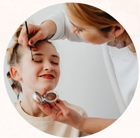
DO MAKE-UP AND HAIR