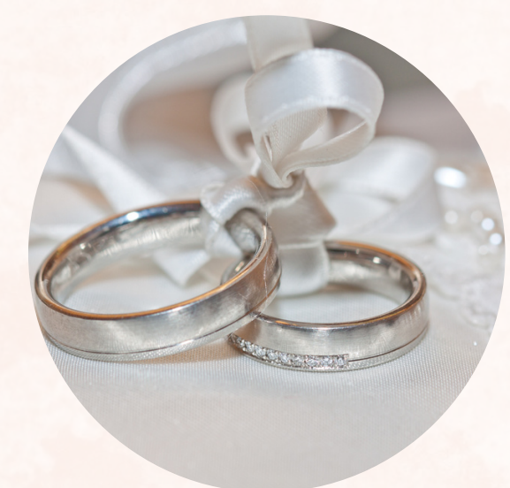
BUY THE RINGS