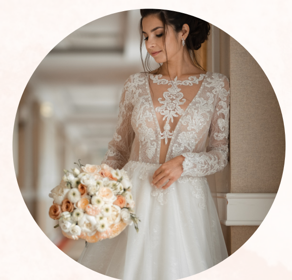
MAKE A DRESS OR SUIT