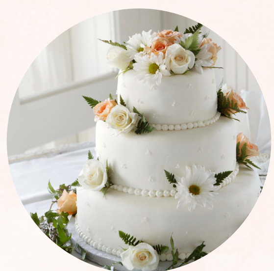
BAKE A CAKE