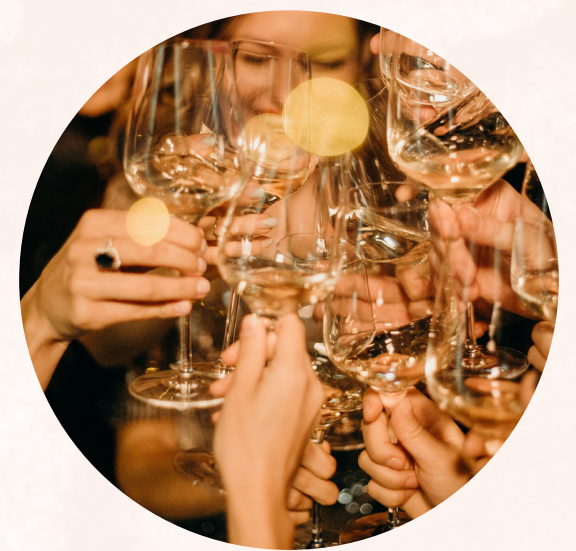
ORGANISE A STAG OR HEN PARTY