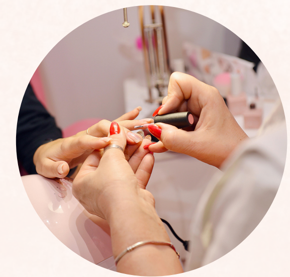
PAINT YOUR NAILS