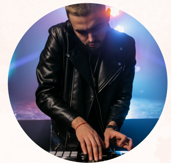
PLAY THE MUSIC