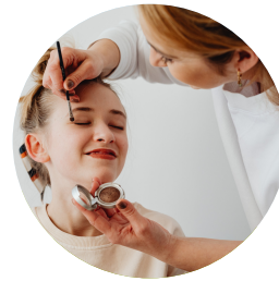
DO MAKE-UP AND HAIR