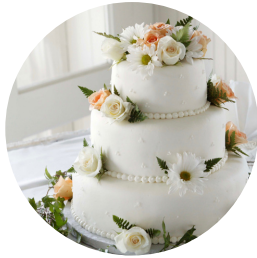
BAKE A CAKE

EXERCISE 1 IMAGINE THAT YOU ARE GETTING MARRIED. WHICH OF THE THINGS BELOW WOULD YOU ASK SOMEONE TO DO FOR YOU? WHY?