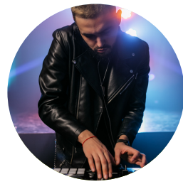
PLAY THE MUSIC