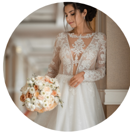
MAKE A DRESS OR SUIT