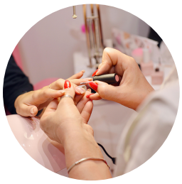
PAINT YOUR NAILS