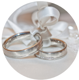
BUY THE RINGS