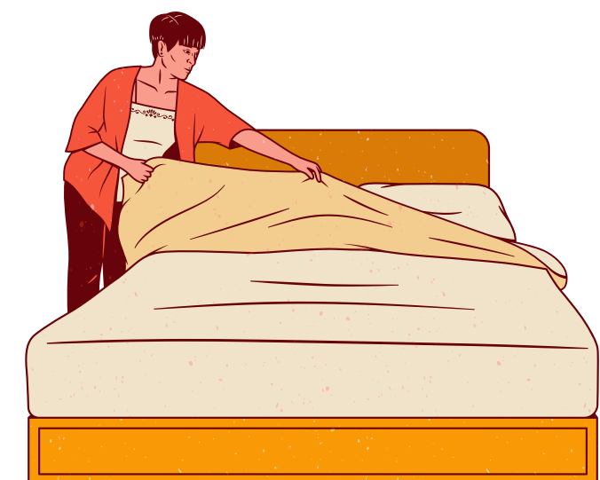
making the bed