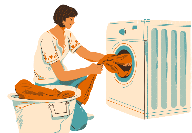
doing the laundry

I don't mind washing the dishes twice a week. In return, you can sweep the floors every day.