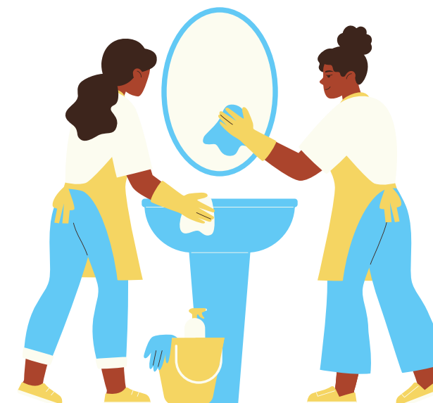
cleaning the bathroom