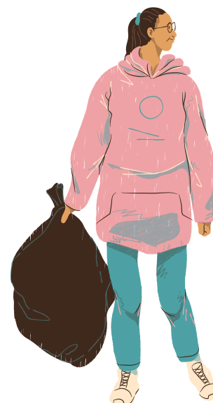
taking the trash out

I don't think it's fair. I think we should all wash our own dishes. I can take the trash out once a week. What do you think?