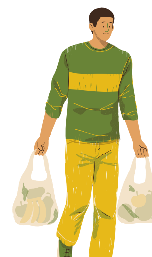
doing the shopping