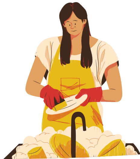
washing the dishes

Imagine that you and your flatmate need to divide the house chores between each other equally. Discuss which tasks would be the best for you and your flatmate and how often you can do them.