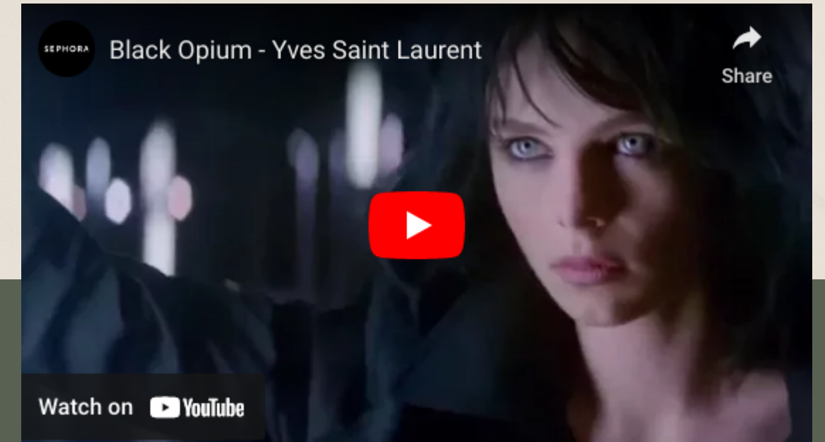
Yves Saint Laurent - Black Opium