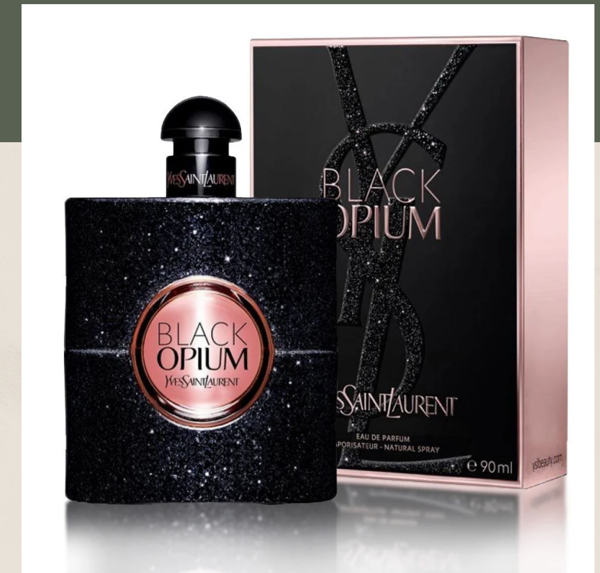
Yves Saint Laurent - Black

This seductive women's perfume is inspired by the edgy and daring woman. Emboldened by the strong scent of coffee, the sensuous warm floral vanilla perfume captivates the senses with a sweet vanilla base and a burst of floral at the heart of the fragrance.