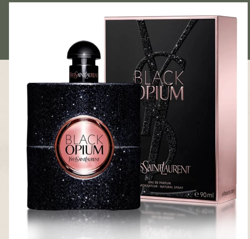
Yves Saint Laurent - Black

With its alluring scent and sharp thorns, the rose symbolises the complexity of femininity. Oil of Jasmine absolutes acts as a gentle yet generous accompaniment to the perfume's heart. An abundance of radiant petals blended with musks, form a sophisticated citrus alliance, which recalls the airy freshness of just-washed linens.