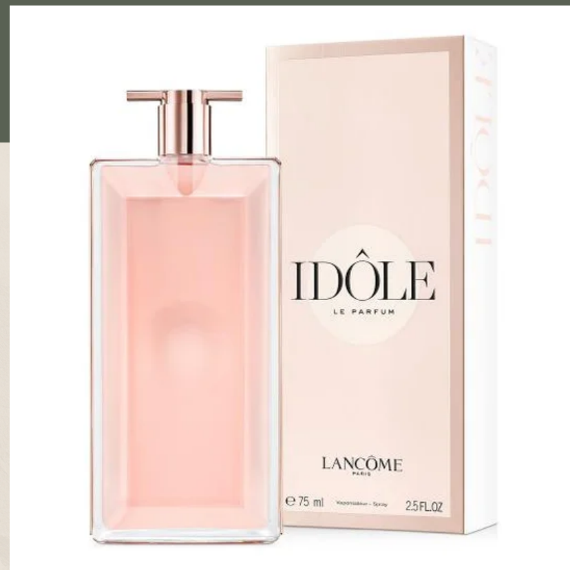
Lancôme - Idôle

Finely crafted down to the last detail, like a custom-made flower, it is a bouquet of the most beautiful flowers from around the world. The essence of Ylang-Ylang with its floral and fruity notes and the essence of Damascus Rose from Turkey blend with a rare duo of Jasmine Grandiflorum from Grasse and Indian Jasmine Sambac, with fruity and voluptuous sensuality.