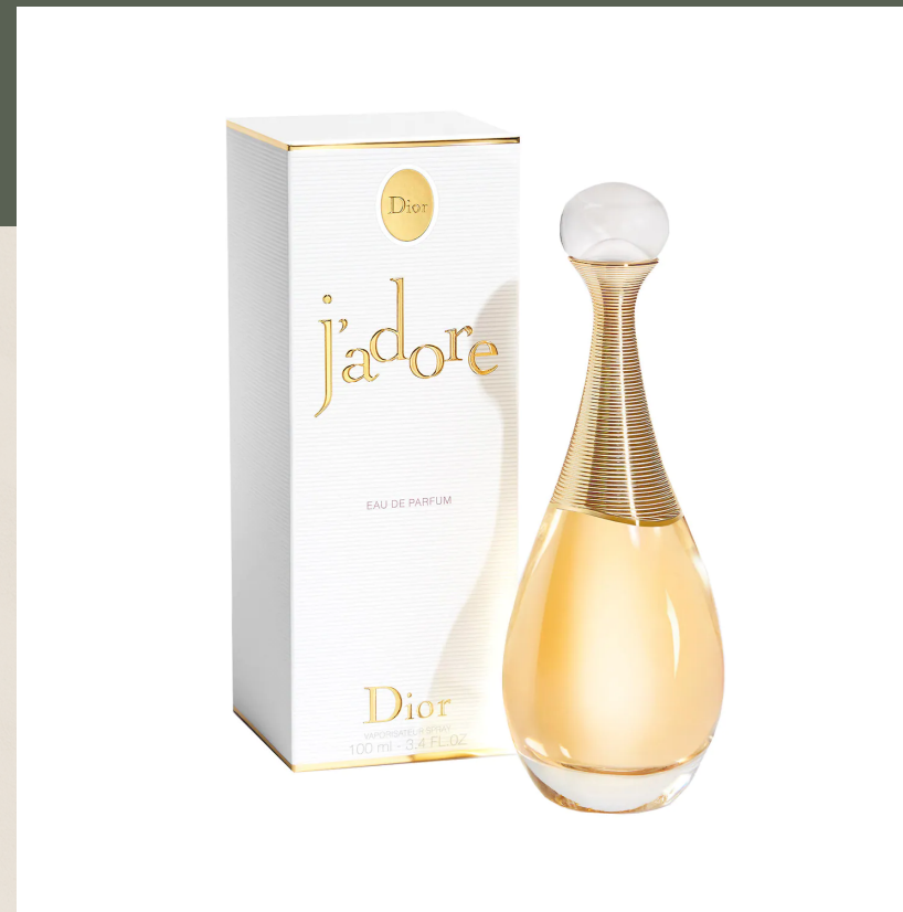
Dior - J'adore

Finely crafted down to the last detail, like a custom-made flower, it is a bouquet of the most beautiful flowers from around the world. The essence of Ylang-Ylang with its floral and fruity notes and the essence of Damascus Rose from Turkey blend with a rare duo of Jasmine Grandiflorum from Grasse and Indian Jasmine Sambac, with fruity and voluptuous sensuality.