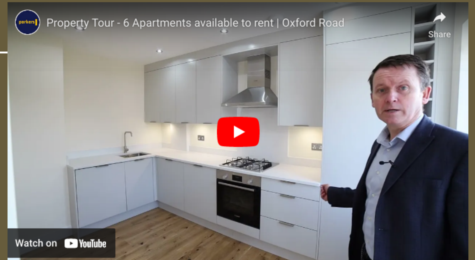
Property Tour - Oxford Road